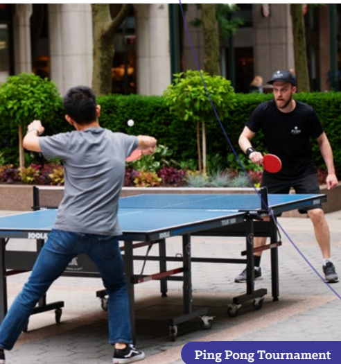
Ping Pong Tournament