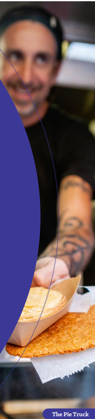
The Pie Truck