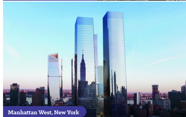
Manhattan West, New York