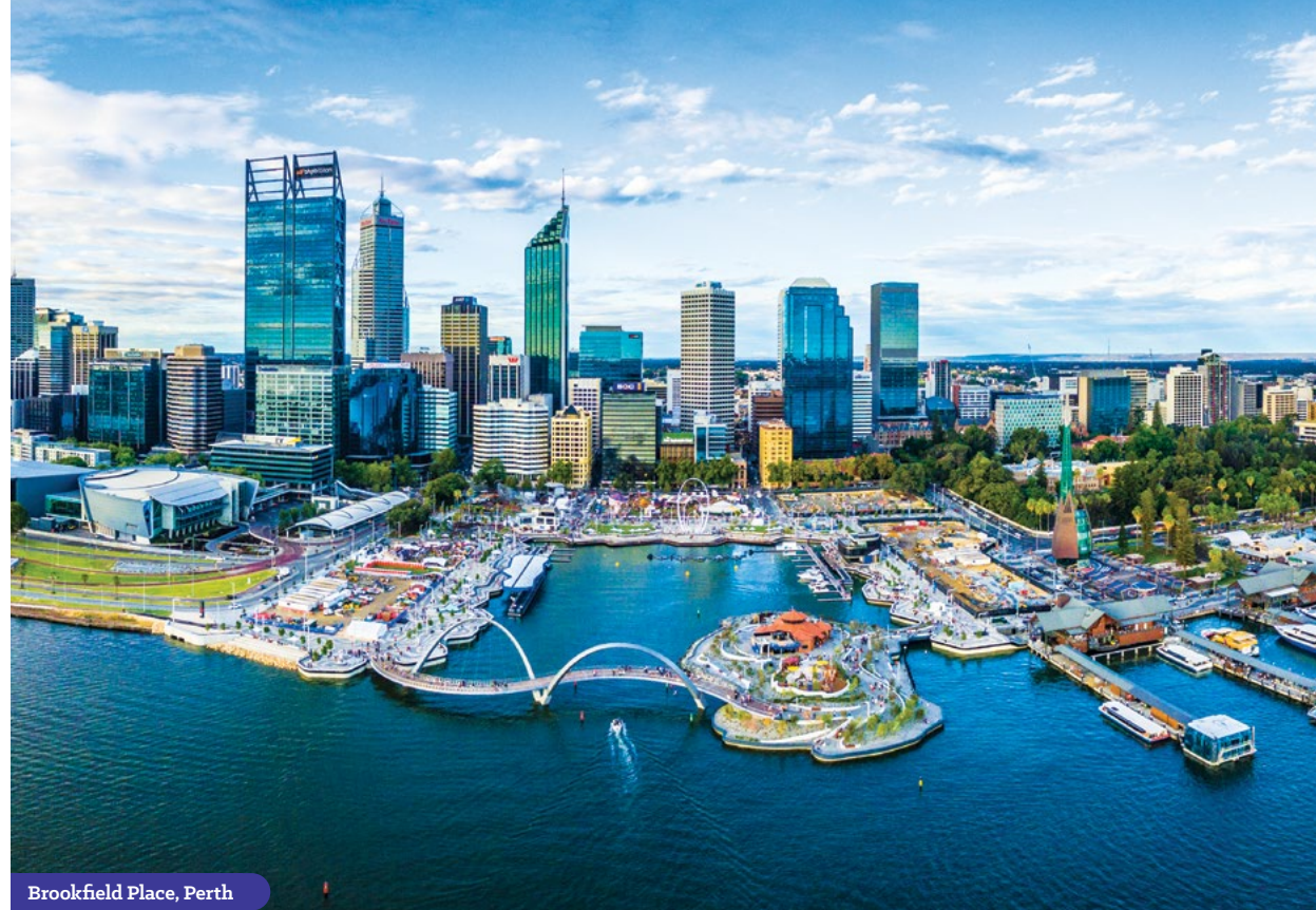
Brookfield Place, Perth