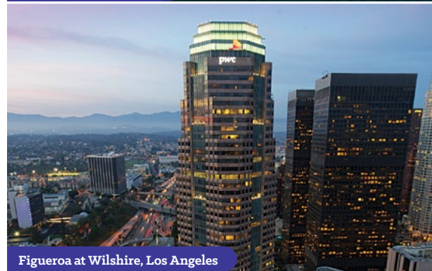
Figuera at Wilshire, Los Angeles