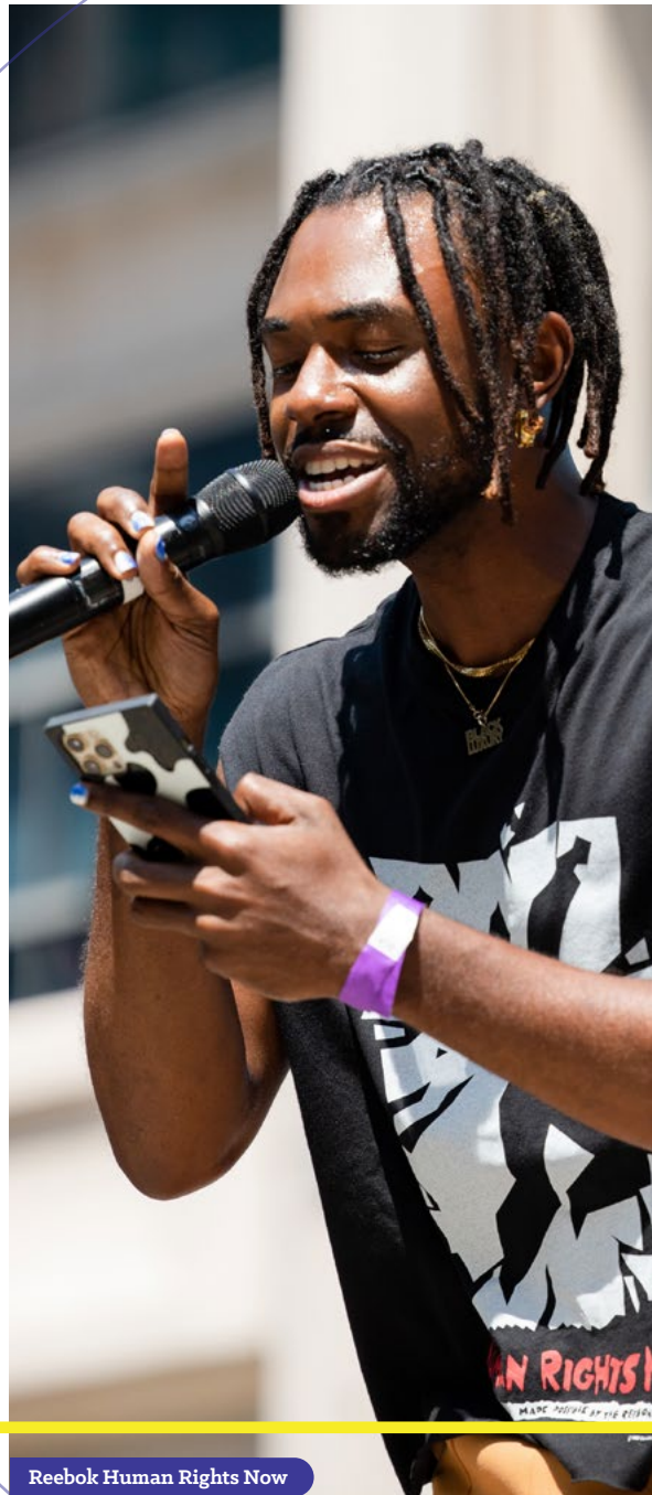
Reebok Human Rights Now